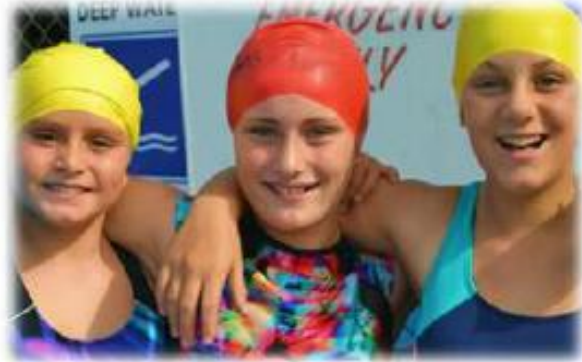
WITH A HEART