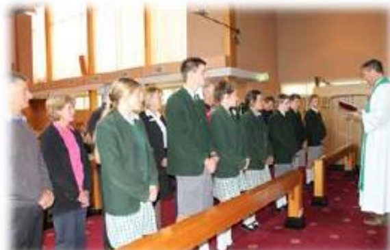
WITH A HERITAGE