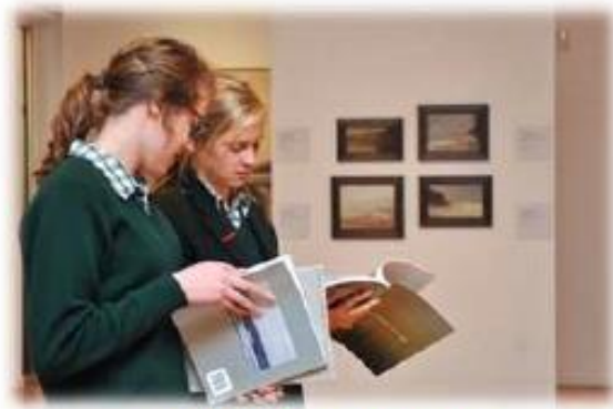
WITH A CONSCIENCE